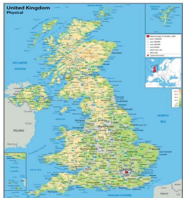
Figure 1: Research Location

Nakamura and Takai (2014) employed a comparable methodology to analyze the dominant energy sources across 89 vent fields. Their study included a range of hydrothermal fluids: hydrogen and methane fluids environments and fluids from rocks sediment high levels of methane and ammonium. Hydrogen sulfide is the primary reources of hydrothermal vents, on other cases where end-member fluid/seawater dilution ratios were very low. However, they found that fluctuations in H 2 S concentrations had minimal effects availability for sulfur-oxidizing microbes (thiotrophs). This also indicated that availability was not significantly affected by the rate of fluid mixing, implying hydrogen sulfide is probably not a limiting factor the production. Instead, primary constraint on overall energy was the provide of oxygen, which was the electron for sulfide oxidation. The study did not take into account of any oxygen in seafloor, which may have resulted in an incomplete assessment of the cycle of energy on microbial things. In contrast, in hydrogen on hydrothermal vents, both two conditions, anerobic and aerobic appear to be more energetically favorable compared to sulfur oxidation (thiotrophy). Unlike sulfur, changes in hydrogen in the hydrothermal significantly influence productivity of energy. In the same conditions, chemical concentrations are believed to greatly affect microbials in hydrothermal systems.